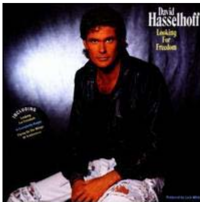
Album Looking for Freedom

But, given some time, some day I'm gonna find The freedom I've been searchin' for