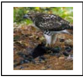
Red tailed Hawk (Lawinczak)