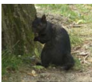
Other Colors (Lawinczak)