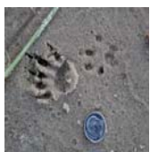
Keepin' Track (Lawinczak)