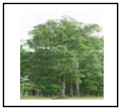
White Oak (NCWC)