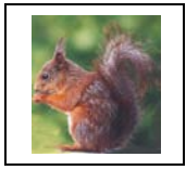
Red Squirrel (Faculty of Life Sciences ELP)