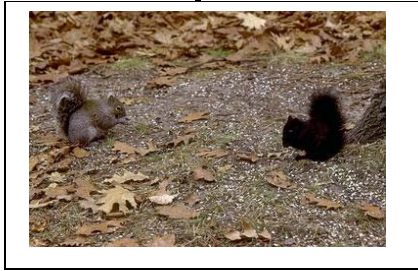
Fellow Gray Squirrel (Lawinczak)