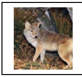
Coyote (Advocacy for Animals)